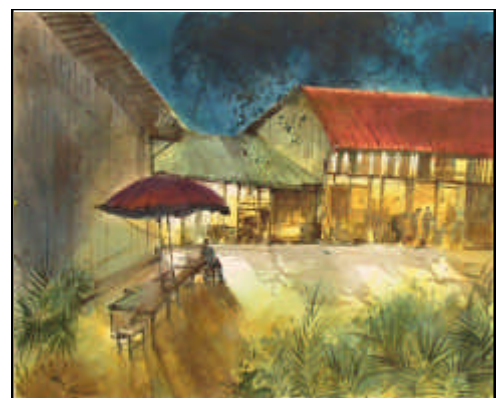
The Square in Ubin, monotype on handmade STPI paper

Stroud Memorial Award (1989), the Lucy B. Moore Award (1988), Paul B. Remmy memorial Award (1983).